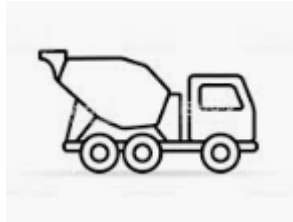
Concrete batch cooling